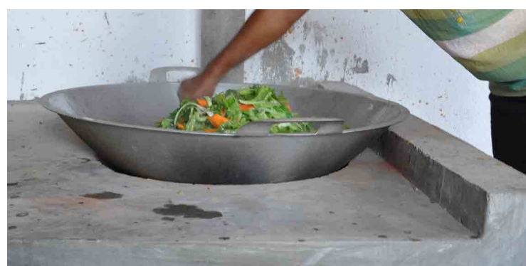
Fuel Efficient Stoves

ADRA Timor-Leste is also able to conduct Stop Smoking Classes and is in the process of using advocacy as a tool to pass laws to protect minors from tobacco's harmful effects by creating smoke free public places.